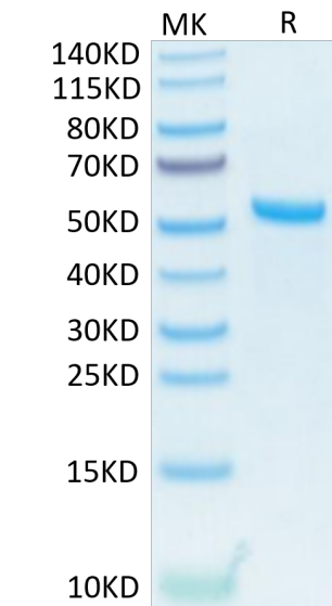
Human APRIL Trimer on Bis-Tris PAGE under reduced condition. The purity is greater than 95%.