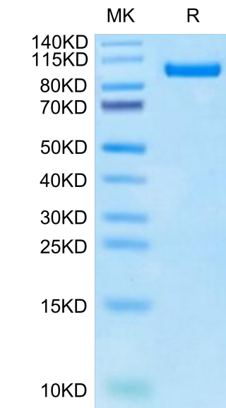
Cynomolgus PTK7 on Bis-Tris PAGE under reduced condition. The purity is greater than 95%.