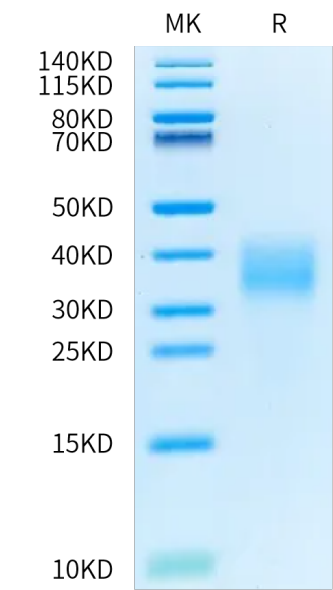
Canine IL-22 on Bis-Tris PAGE under reduced condition. The purity is greater than 95%.