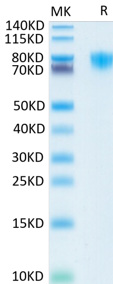
Human PDGF R alpha on Bis-Tris PAGE under reduced condition. The purity is greater than 95%.