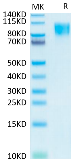
Human PDGF R beta on Bis-Tris PAGE under reduced conditions. The purity is greater than 95%.