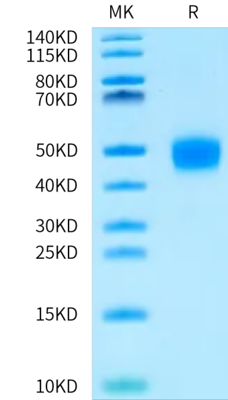
Cynomolgus Coagulation factor III on Bis-Tris PAGE under reduced condition. The purity is greater than 95%.