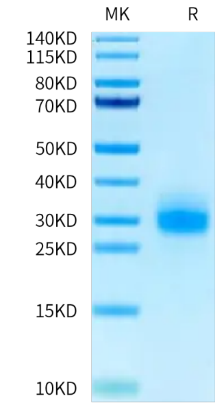
Human TNFRSF19 on Bis-Tris PAGE under reduced condition. The purity is greater than 95%.